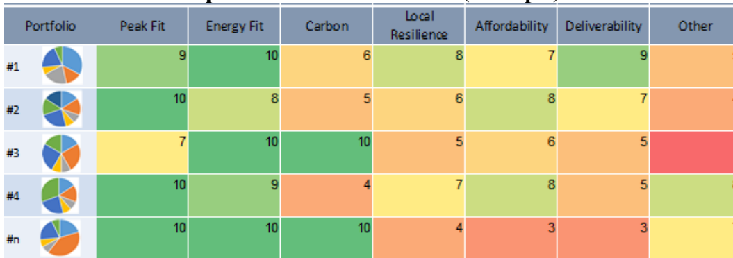
Optimized Portfolio Metrics (Example)

In the end, EWEB will have a set of portfolio options that demonstrates the tradeoffs between various resource mixes. The chart below shows how theoretical portfolios (on the left) compare to each other across a variety of metrics such as peak fit, energy fit, carbon intensity and other metrics determined by the Board. These portfolio options will serve as launching points for board discussion and direction and will ultimately help inform the Board’s action plan.