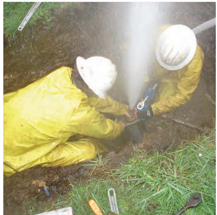
Distribution crew repairing water main break.