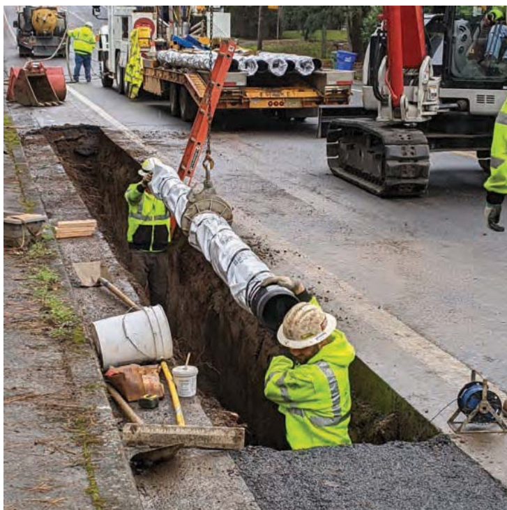
Distribution crew replace water main at Chambers Street.

Once EWEB determines that there are no issues with the water, EWEB will leave a door hanger communicating water is safe to use and consume.