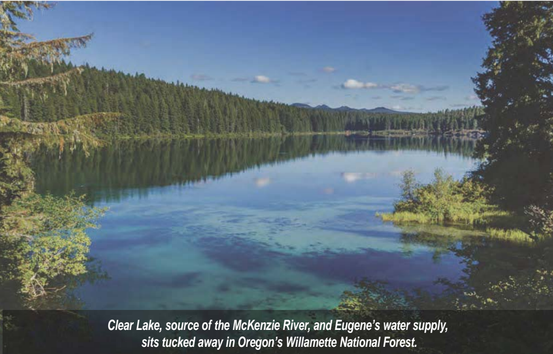
Clear Lake, source of the McKenzie River, and Eugene's water supply, sits tucked away in Oregon's Willamette National Forest.